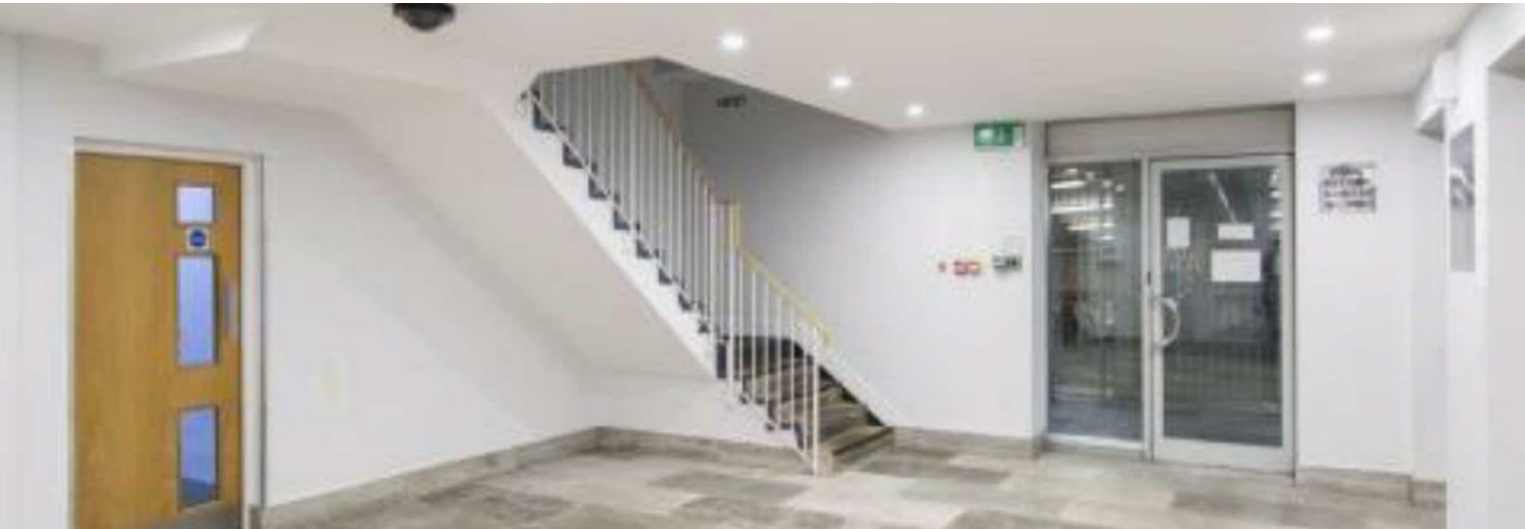
GROUND FLOOR 347 sq.ft. (32.2 sq.m.) approx.